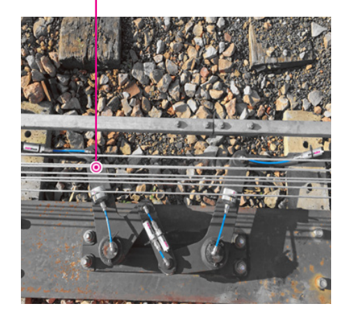
Two 30 ml simalube lubricators and four 15 ml simalube dispensers continuously lubricate the compensator of a signalling system.