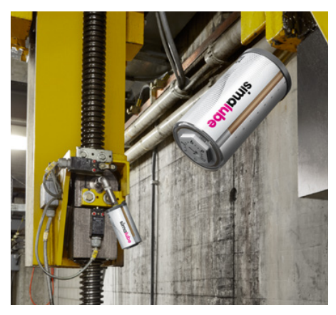
The spindles of a lifting station for railway wagons and locomotives are lubricated with 125 ml simalube over 12 months.