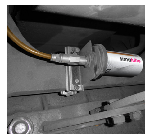
The 125\,\mathrm{ml} dispenser is installed on the chassis of a low floor tram. The lubricant is directed through a hose to the lubrication point.