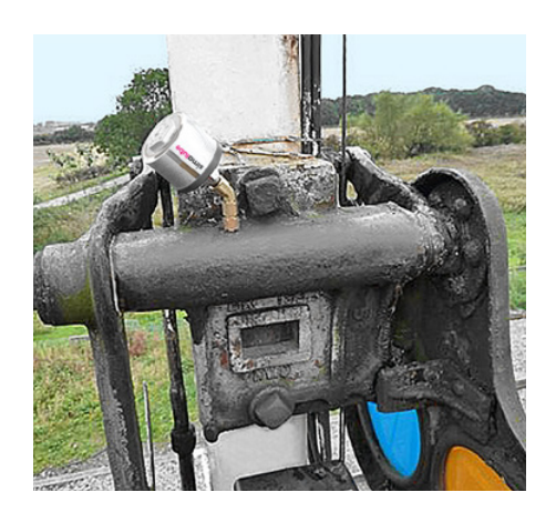
The plain bearing of a railway signal is automatically and continuously lubricated by a 30 ml simalube lubricator.