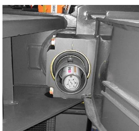
The coupling of two railway cars is lubricated with a simalube 125 ml lubricator.