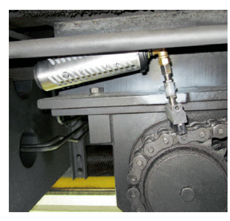
The simalube 250 ml lubricant dispenser lubricates the drive chain of a rail crane. A protective cover protects the dispenser.