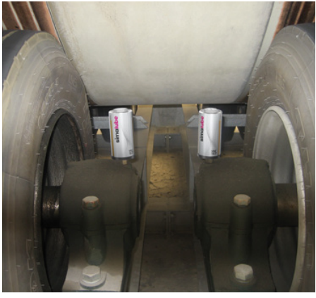
The lubricators are connected directly to the vertical bearing on the drive of a conveyor belt.