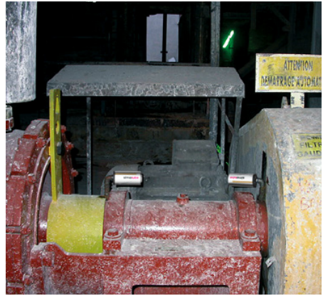
Permanent bearing lubrication on the main drive shaft of a filter pump.