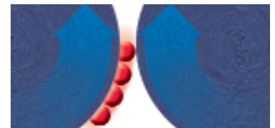
Under pressure, TOTAL ALTIS® becomes smoother and spreads regularly between the 2 surfaces.

All kind of bearings : ball, roller etc.